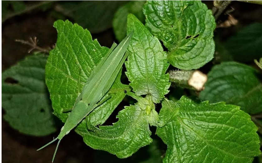
Fig. 1: Oriental longheaded locust ( Acrida cinerea )