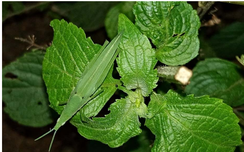
Fig. 1: Oriental longheaded locust ( Acrida cinerea )