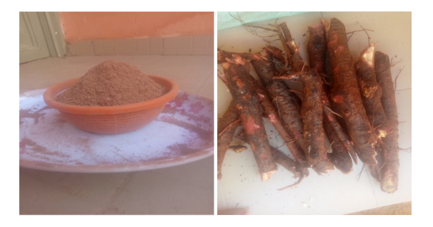
Fig. 1: Powder and roots of Khaya anthotheca

Extraction of plant material: The 150 g powdered sample was put into a flask and for seven days, while shaking occasionally and letting it stand at room temperature, methanol was used to extract the phytoconstituents. The mixture was concentrated in a rotary evaporator (Gaithersburg, Maryland, United States)